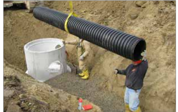
Photo illustrates single sling handling used for the smaller diameters, sloped trench walls to mitigate against the need of a trench box, and stone bedding above the trench foundation.

This guideline does not attempt to address installation practices common to all pipe types (e.g. line and grade, working in an upstream direction), but only those features that are important in securing pipe support from the embedment material. Consistent with that objective, no attempt is made herein to address safety concerns associated with the installation of corrugated HDPE pipe or underground construction in general. It is the responsibility of the user of this guide to establish appropriate safety and health practices and determine the applicability of regulatory limitations prior to use.