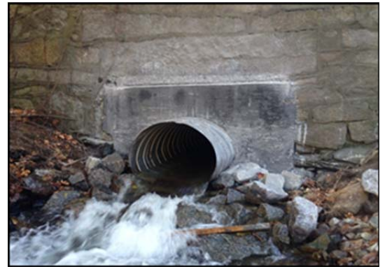
Outfall of the newly relined stone masonry culvert completed as part of the reconstruction of Route 44 in Smithfield, Rhode Island near Smith Avenue (Route 116).

The spiral rib profile is a corrugation with outwardly projected rectangular ribs and a smooth interior with a Manning's roughness coefficient of 0.012, primarily developed for storm sewer applications, but ideal as a reline material due to the narrow wall profile and smooth interior (see Figure 1 opposite page). With the ability to manufacture corrugated steel pipe in custom sizes, the spiral rib reline pipe was arched to the specified dimensions, matching the hydraulic capacity of the existing structure with a slight increase in grade, and thereby eliminating any additional bureaucracy associated with changing the impact upstream or downstream of the culvert.