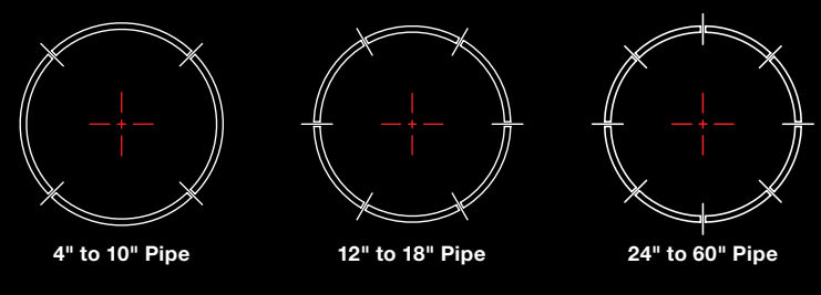
Figure 2. Class 2 Perforations

Minimum values shown (dimensions vary between plants).