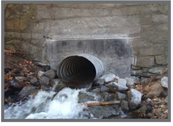
Outfall of the newly relined stone masonry culvert completed as part of the reconstruction of Route 44 in Smithfield, Rhode Island near Smith Avenue (Route 116).

The call for trenchless methods was apparent. Relentless traffic from a bottlenecked commuter thoroughfare, a critical waterway 12' to 14' beneath with a series of upstream dams regulating flow, and all the buried utilities we have come to expect.