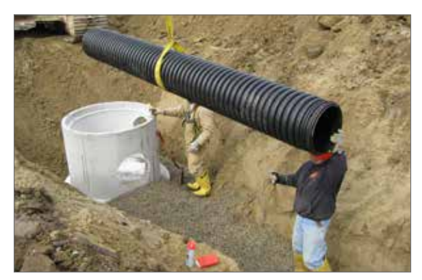
Photo illustrates single sling handling used for the smaller diameters, sloped trench walls to mitigate against the need of a trench box, and stone bedding above the trench foundation.

This guideline does not attempt to address installation practices common to all pipe types (e.g. line and grade, working in an upstream direction), but only those features that are important in securing pipe support from the embedment material. Consistent with that objective, no attempt is made herein to address safety concerns associated with the installation of corrugated HDPE pipe or underground