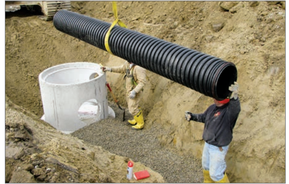
Photo illustrates single sling handling used for the smaller diameters, sloped trench walls to mitigate against the need of a trench box, and stone bedding above the trench foundation.

This guideline does not attempt to address installation practices common to all pipe types (e.g. line and grade, working in an upstream direction), but only those features that are important in securing pipe support from the embedment material. Consistent with that objective, no attempt is made herein to address safety concerns associated with the installation of corrugated HDPE pipe or underground construction in general. It is the responsibility of the user of this guide to establish appropriate safety and health practices and determine the applicability of regulatory limitations prior to use.